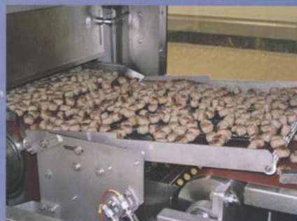
The product is flipped to get contact cooking on both sides