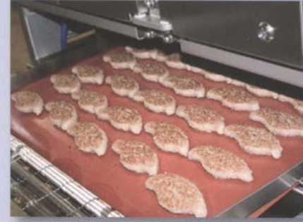
Contact cooking gives a nice colour and a fully cooked product if desired