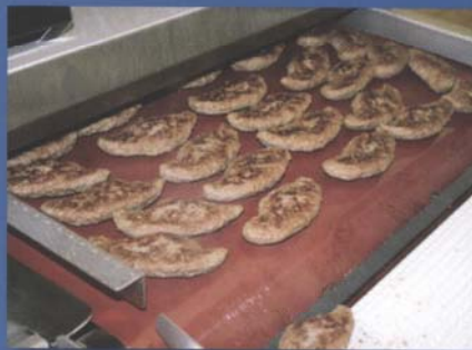
A perfect result with a home made appearance and fully cooked