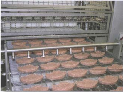
Wiking 6 forms precise with very small differences in weight